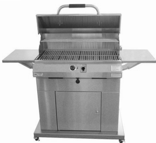
32" MODEL IS 4400-EC-448-CB-S-32 (SINGLE CONTROL)

Required Outlet: NEMA 6-50R Receptacle 208/220 Volt 50 Amp receptacle 50/60 Hz (use with 40 Amp breaker)