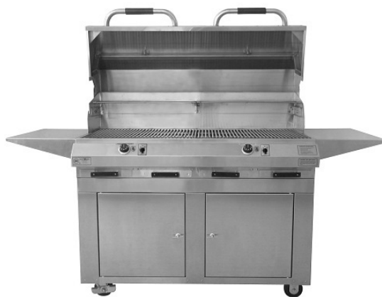
48" MODEL IS 8800-EC-1056-CB-D-48