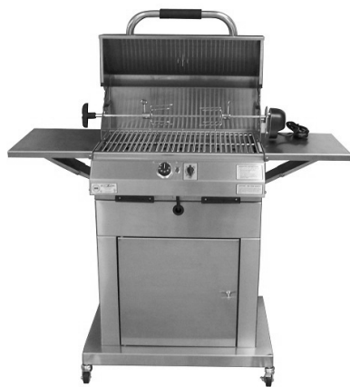
24" MODEL* IS 4400-EC-336-CB-24