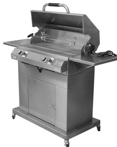
32" MODEL* IS 4400-EC-448-CB-D-32 (DUAL CONTROL)

Required Outlet: NEMA 6-30R Receptacle 208/220 Volt 30 Amp receptacle 50/60 Hz